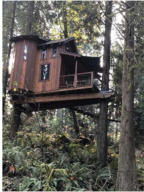
Photo Caption: This tree house can be seen from a section of Trail Six that leads out of Marshall Park to Southwest Eleventh. SW Trails PDX is hoping to secure funding from ODOT to complete Trail Six so it doesn't have to leave the park.