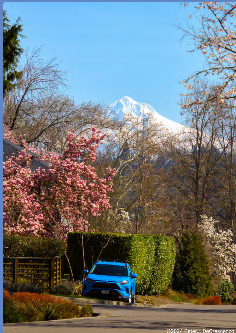
View of Mount Hood