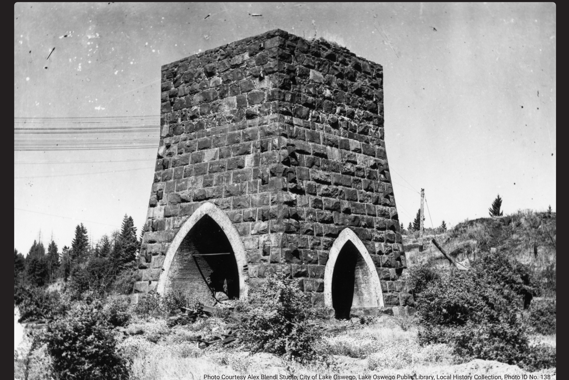
Oswego Iron Furnace

Lake Oswego has a heavy industrial past. Its first charcoal iron furnace began production in 1867 in modern-day George Rogers Park. It operated intermittently until 1881 as the Oswego Iron Company, and later as the Oregon Iron & Steel Company. By 1888 the company built a new smelter on today's Oswego Pointe. At its peak, the industry employed some 300 men, primarily Chinese loggers. Oswego boomed by 1890, boasting general stores, a bank, barber shops, hotels, churches, saloons, and a drugstore. Economic recessions caused the furnace to close in 1894. Scan the QR code above to learn more.