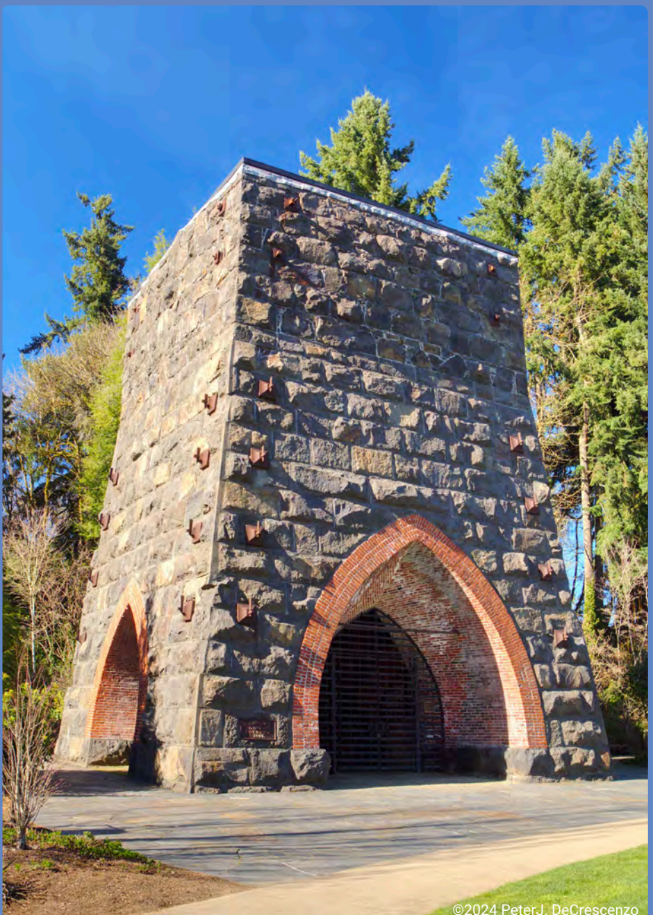
Oswego Iron Furnace