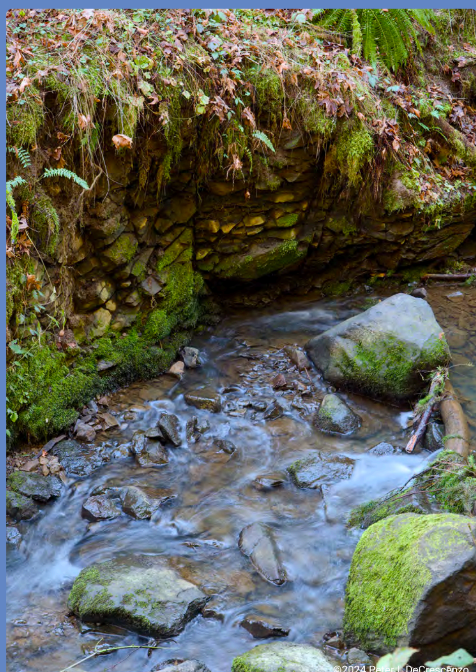
Exposed sediment layers